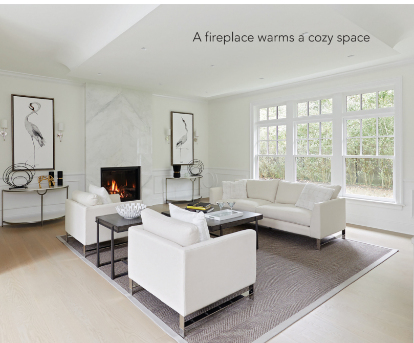
A fireplace warms a cozy space

The lower level is designed around a long, full-height window gallery hall that connects spectacular accommodation and entertainment spaces all bathed in natural light. The home theater was professionally designed and installed with an acoustic ceiling featuring a color changing LED night sky constellation, color changing LED acoustic fabric paneled walls and three tiered rows of leather European armchair seating which include two chaises for full-on lounging. A full size gym