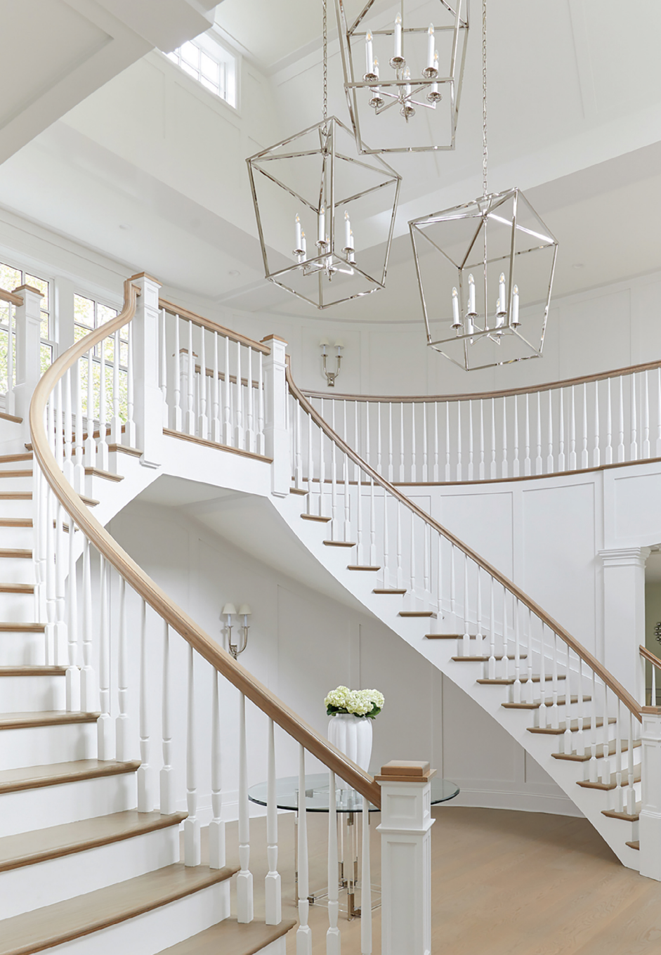
A soaring staircase welcomes

moldings, sophisticated wall and ceiling paneling, and illuminated architectural ceiling details were created and installed by premier fabricator, Wood & Co. Uniquely designed marble, porcelain and glass wall and floor installations, wide plank select oak flooring and sensational decorative lighting contribute to making this home a veritable masterpiece of design and craftsmanship. Five distinctively designed marble fireplaces ensure warmth and coziness in the cooler seasons. No expense was spared for the environmentally mindful geothermal heating and cooling systems, heated shower benches and flooring, as well as climate, sound and security system automation. Laundry facilities are conveniently located on both the main and second floors.