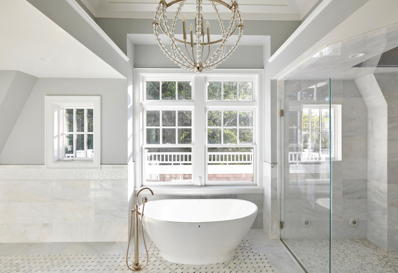
Deep tub comfort awaits