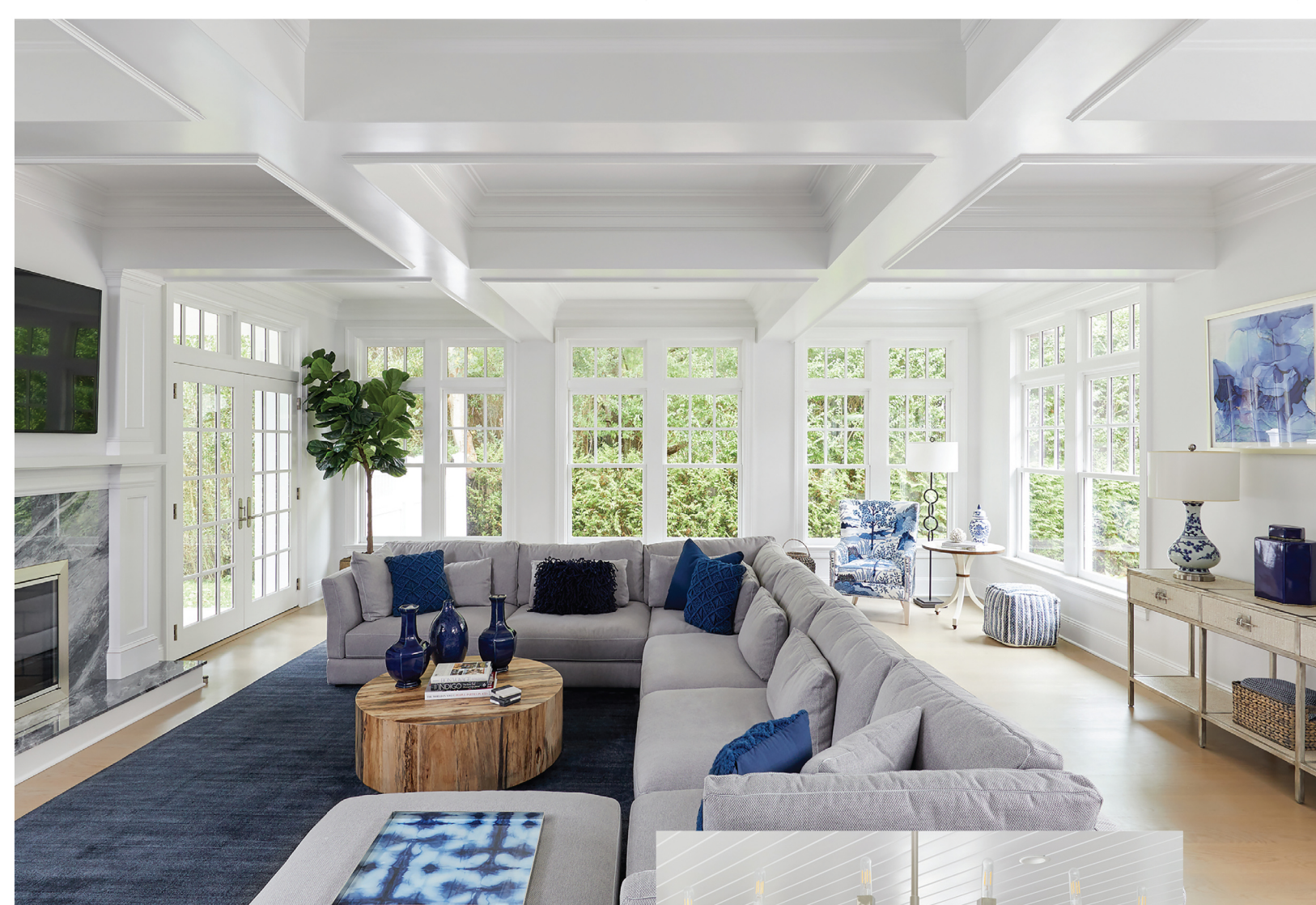
A sunny living room beckons

fully equipped with a long list of luxury brand appliances and has two marble topped islands for effortless food preparation and serving. Within the kitchen, the butler's pantry and wet bar conveniently serve the adjacent dining room and family room with bar sinks, refrigeration, coffee prep and customized storage. Casual kitchen dining takes place on island counter stools and a large table that seats 12. Two separate sets of French doors lead outside to the country club backyard and to a spacious covered porch with views of the expansive open lawn and pool.