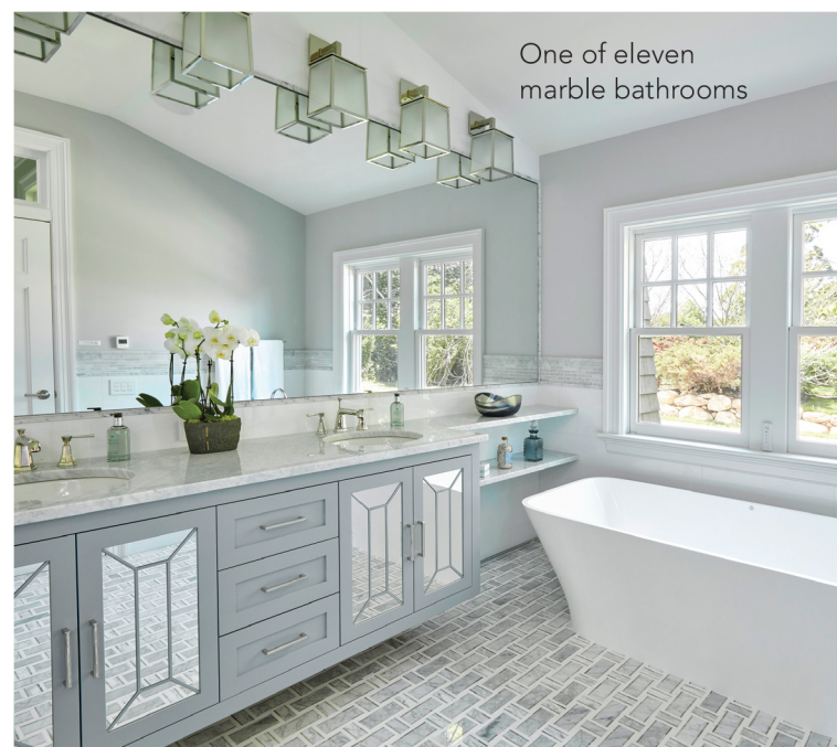
One of eleven marble bathrooms