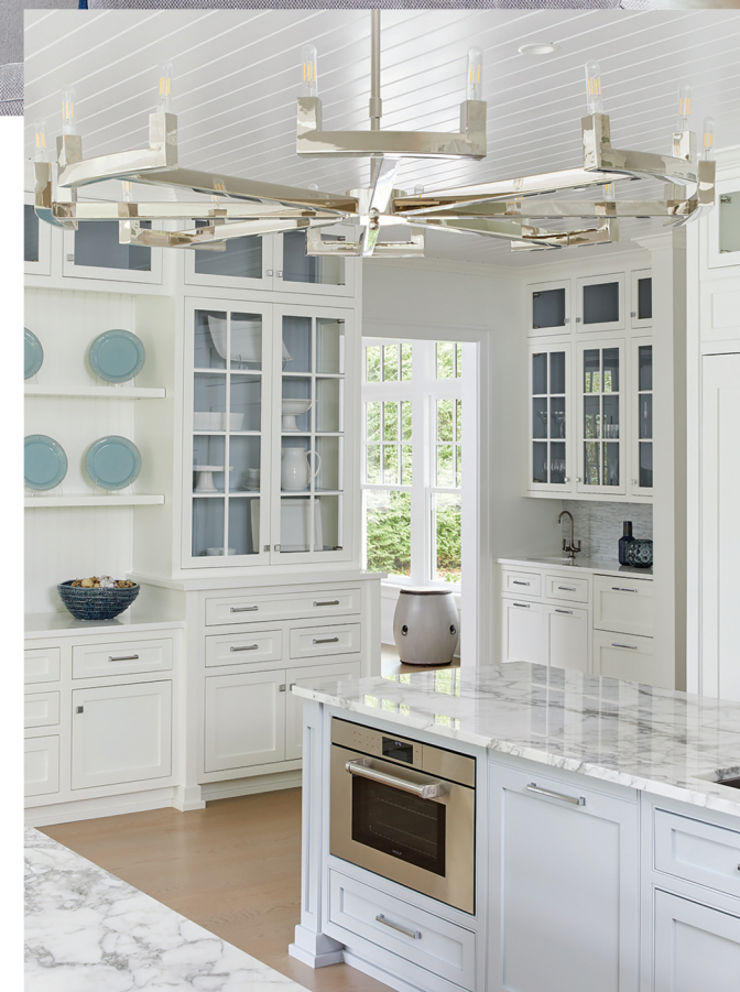
Full amenities grace the kitchen