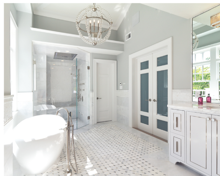
Beautiful floor tiles accent

with mirrored walls and large windows is served by a steam shower and dedicated sauna. Designed with the serious collector in mind, the wine cellar was customized with floor to ceiling, wall-wide bottle storage accessed by a wheeled library ladder, a long tasting counter with its own sink and artisanal cabinetry. A concealed door leads to a case storage room. The adjacent lounge with its massive bar area takes entertainment to new heights.